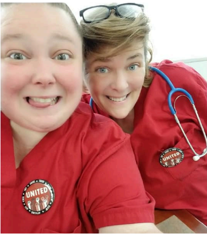
Teamsters Local 507 * Ohio