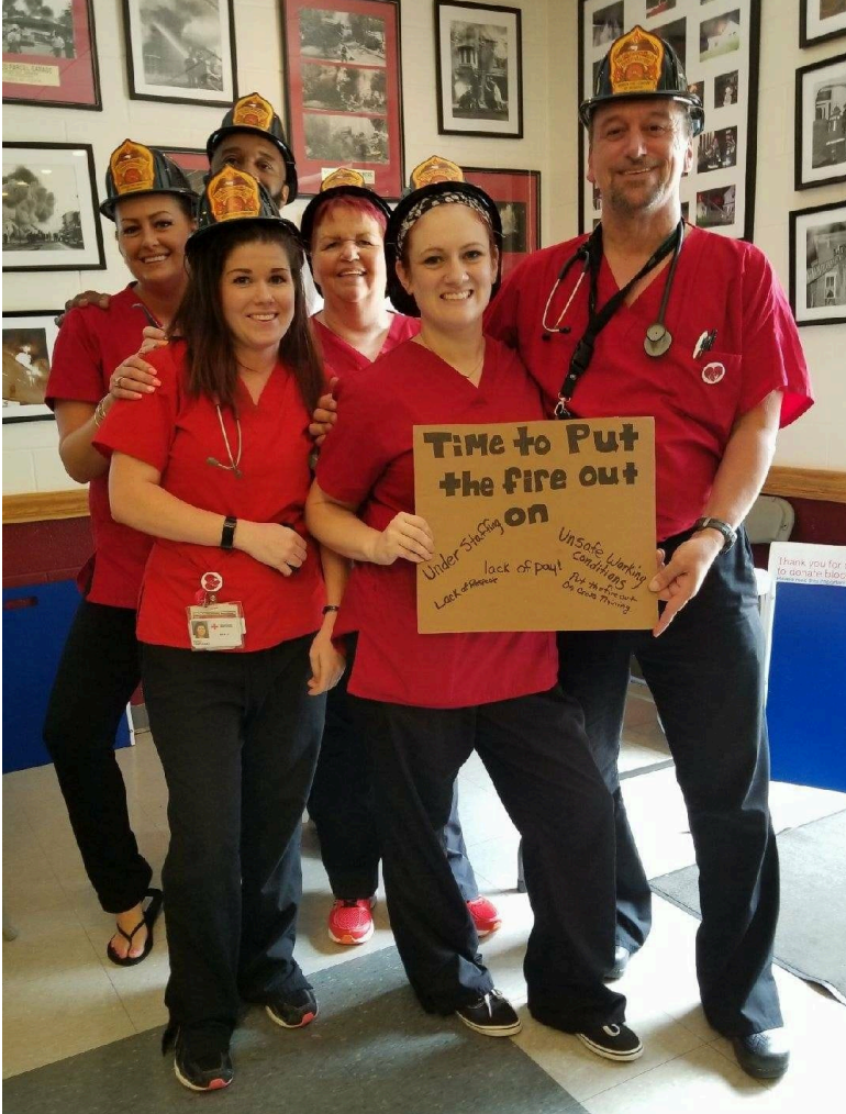
HPAE/AFT Local 5103 * Penn-Jersey

We reached tentative agreements on some important issues, including worker safety and more flexibility when scheduling rest breaks.