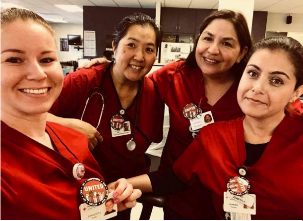
SEIU Local 721 * Southern California