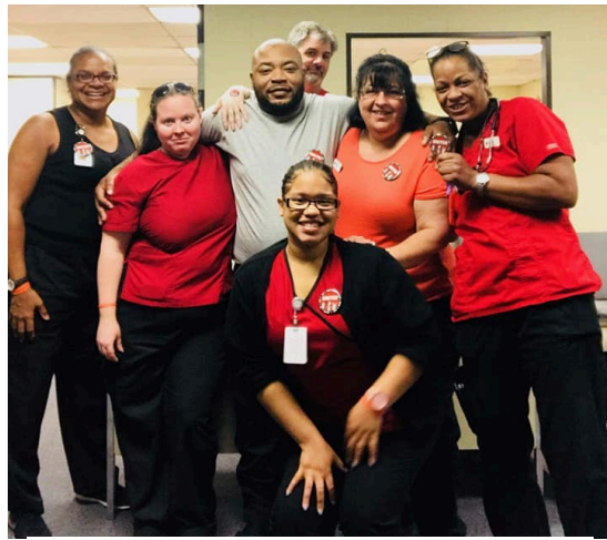
CWA * Albany NY