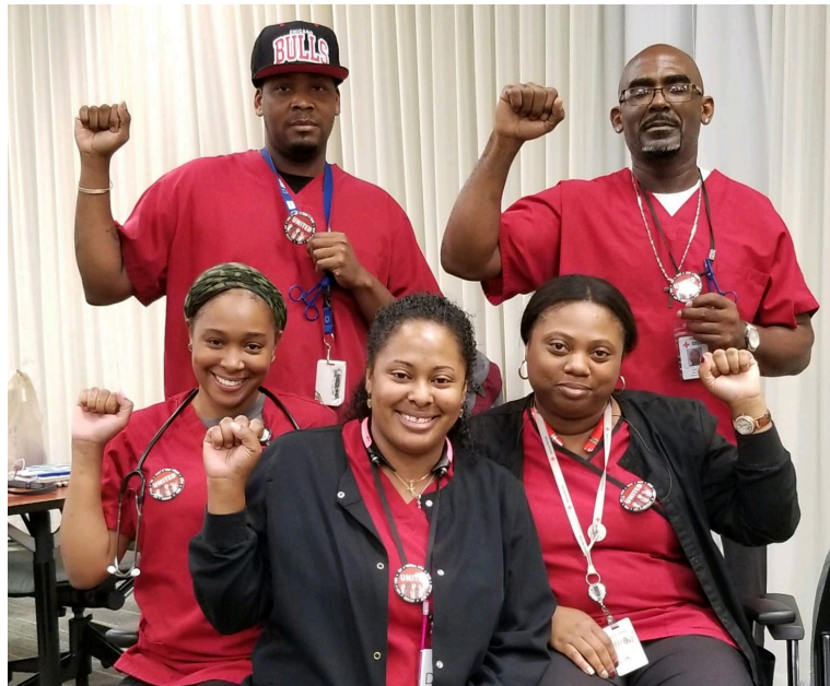
USW Local 254 * Georgia

Many Red Cross workers are not paid livable wages and it is a struggle to make ends meet. While the Red Cross responds effectively to the needs of disaster relief victims and provides other critical services, it oftentimes fails to address the basic needs of its employees who perform this work. We want to know more! Please take time to complete the survey link sent to you this week from your union. Remind your co-workers to complete the surveys. The Union bargaining committee and public relations team will collect and communicate your concerns.