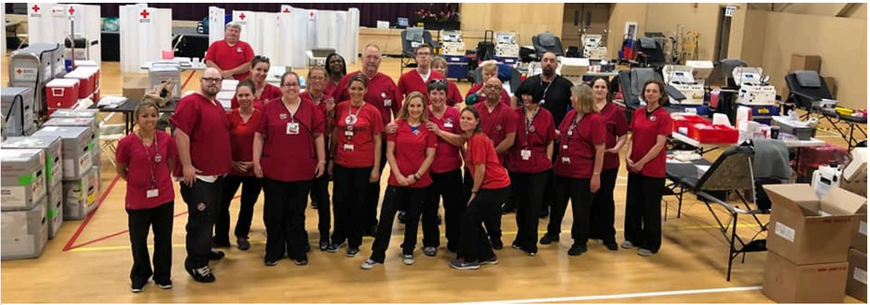
UAW Local 2322 * Massachusetts

We are wearing buttons to show Red Cross that we are paying attention to these negotiations and that we care about the outcomes.