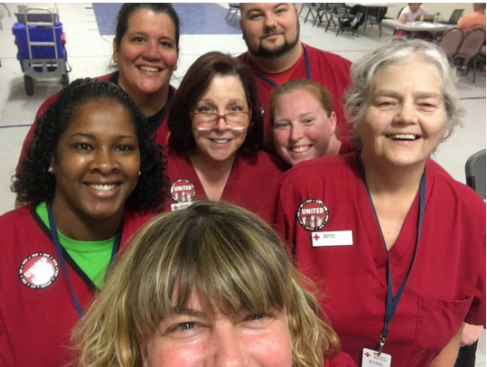
CWA Local 13500 * Pennsylvania